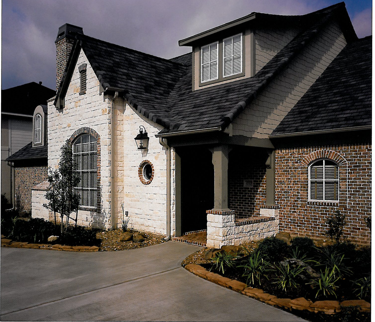
This uniquely designed custom home was built on the owner's lot by the affiliated company, Dominion Custom Homes. The combination of stone and brick, Hardishake siding, and radius rooflines gives this home an "Old World Cottage" feel.