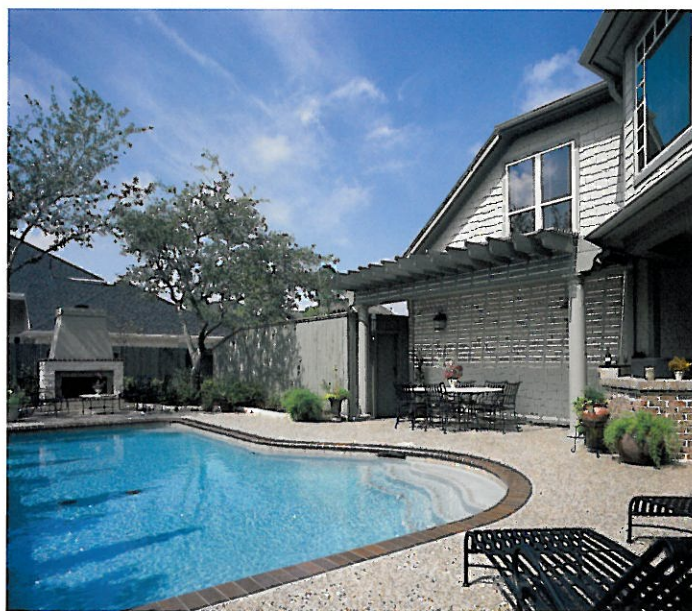
This relaxing backyard setting is an example of the diversity HNI Services offers its clients. They installed the beautiful pool adorned with lush landscaping, a patio area with a unique outdoor fireplace and created the convenient summer kitchen for entertaining. The pergola provides the perfect shady location for outdoor dining and celebrating.

For further information about HNI Services, you may contact them at (281) 488-8201. You may also visit their Web site at www.hnibuilt.com . ■