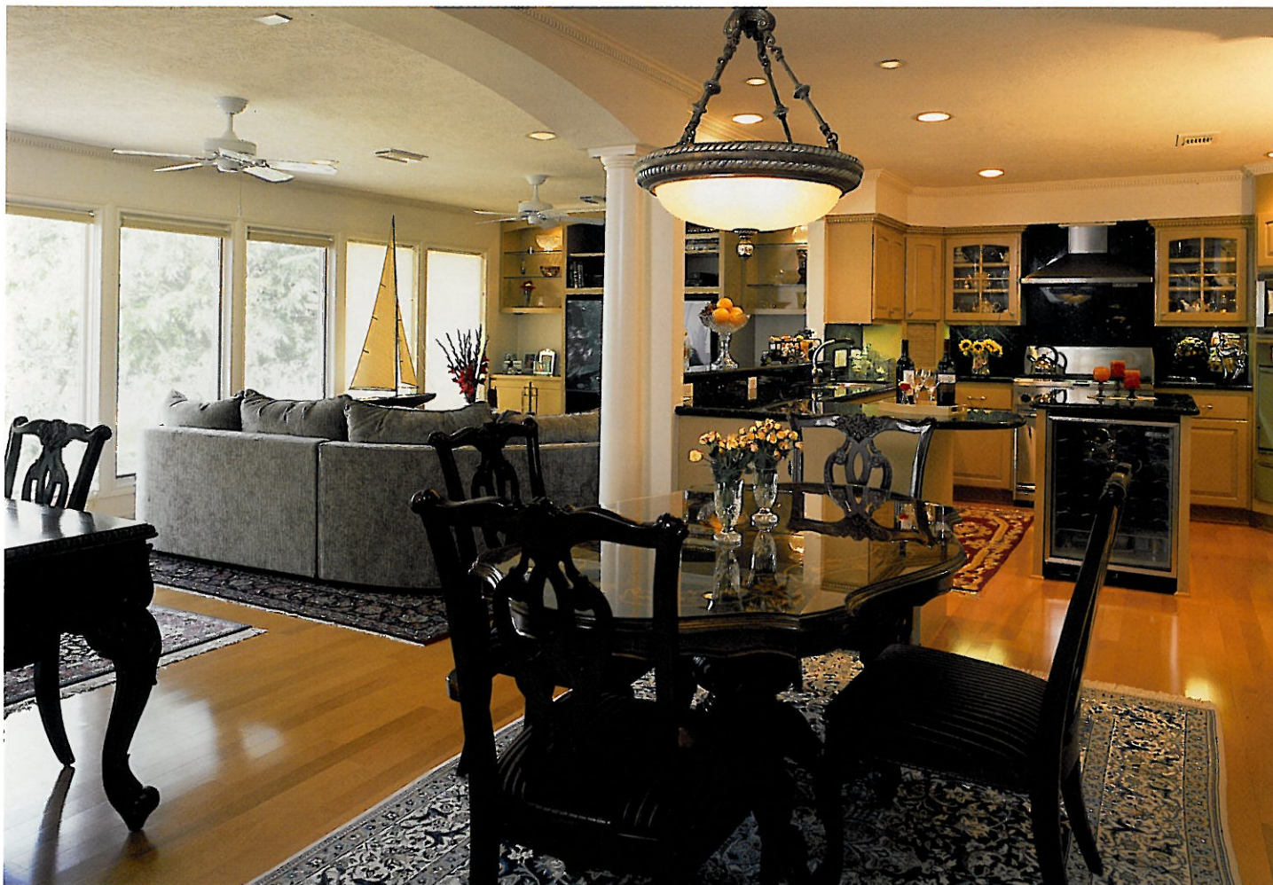
This lake house kitchen renovation involved removing the outside wall and enclosing the existing outdoor balcony. The area was beautifully transformed into a comfortable den area for relaxing and staring out at the calming water. The kitchen was updated with custom-built maple cabinets with an antique finish and given granite countertops for a sleek, sophisticated appearance.